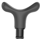
mini achilles massage head