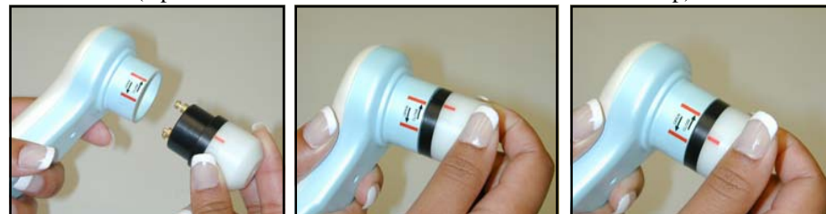
Position the lens

(Optional: 50x Lens for Face or 200x Lens for Hair Scalp)