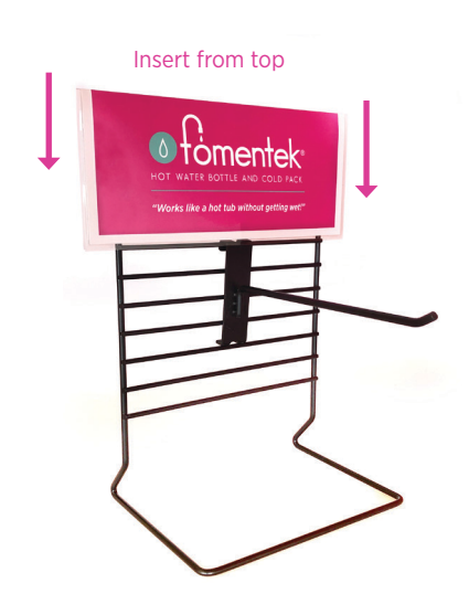
3. Insert the Fomentek Header from the top.