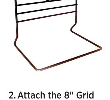
Hook on the 4th bar from the top