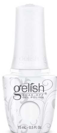
SOAK-OFF GEL POLISH

Apply NO CLEANSE TOP COAT to the entire nail making sure to cap the free edge. Cure for 60 seconds. Finish your look by massaging NOURISH Cuticle Oil into the skin surrounding the nail plate. Enjoy your finished look.