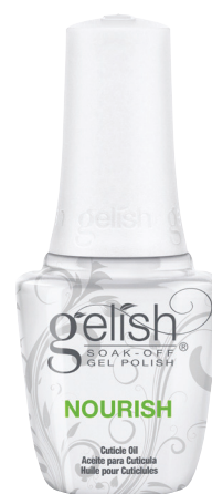
NOURISH CUTICLE OIL