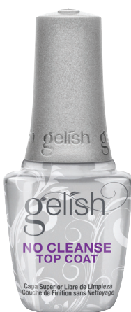
NO CLEANSE TOP COAT