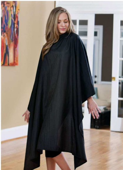
Betty Dain Super Size Styling Cape