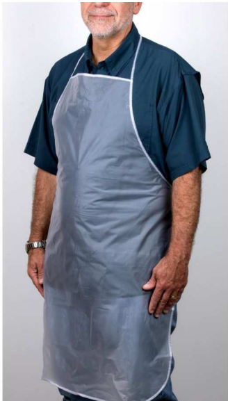
Long Vinyl Bib Apron