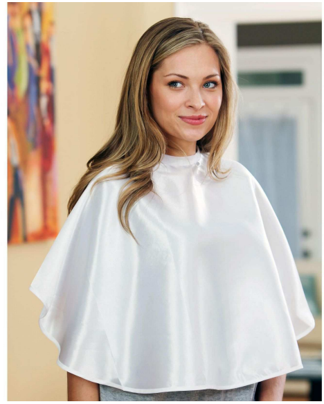
Canyon Rose Esthetician's Client Cape, White