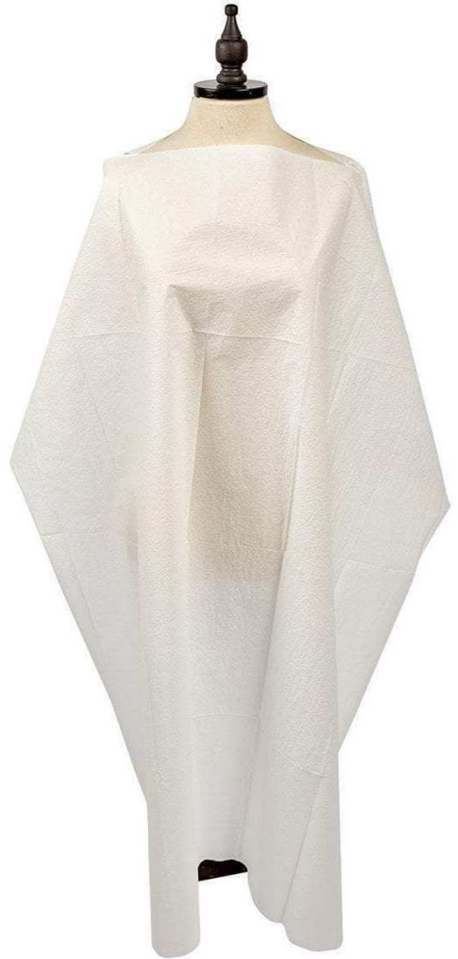
Disposable Poly Bib Aprons, 100 ct NB127 $35.00 $31.50 each when you buy a case of 10