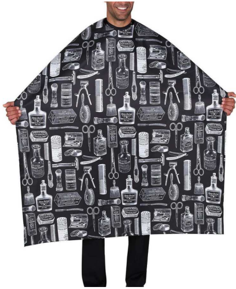
Betty Dain Vintage Barber Cape