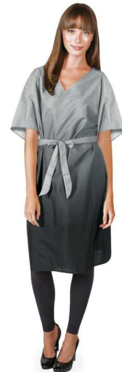
Betty Dain Uptown Client Wrap / Black