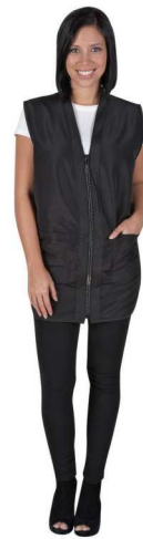
Betty Dain Glitz Vest Size XXL. N2173 $32.95