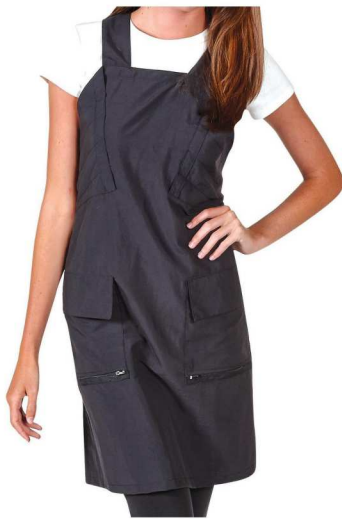
Betty Dain Criss Cross Apron N2166 $22.95