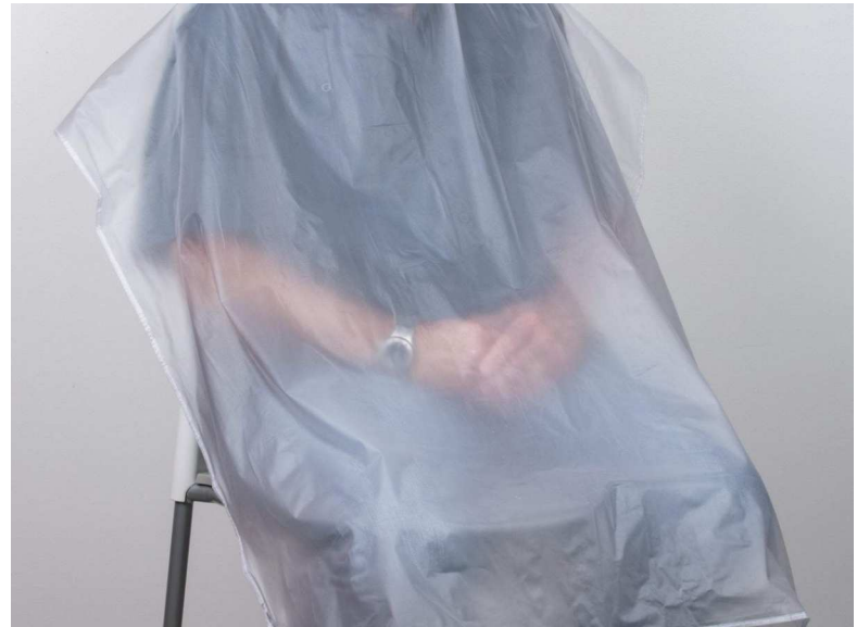
Protective Vinyl Client Cape