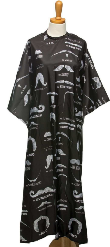
Betty Dain Men's Stache Styling Cape, Black