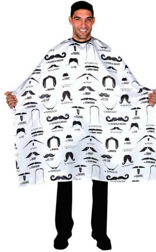
Betty Dain Stache Styling Cape