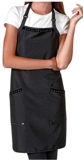
Betty Dain Glitz Apron N2168 $23.95