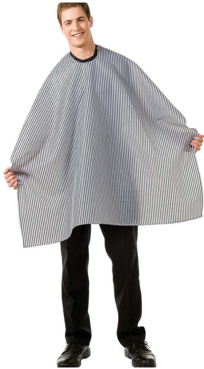
Betty Dain Classic Seersucker Barber Cape N2178 $13.95