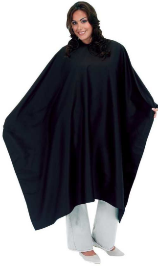
Betty Dain Plus Size Styling Cape