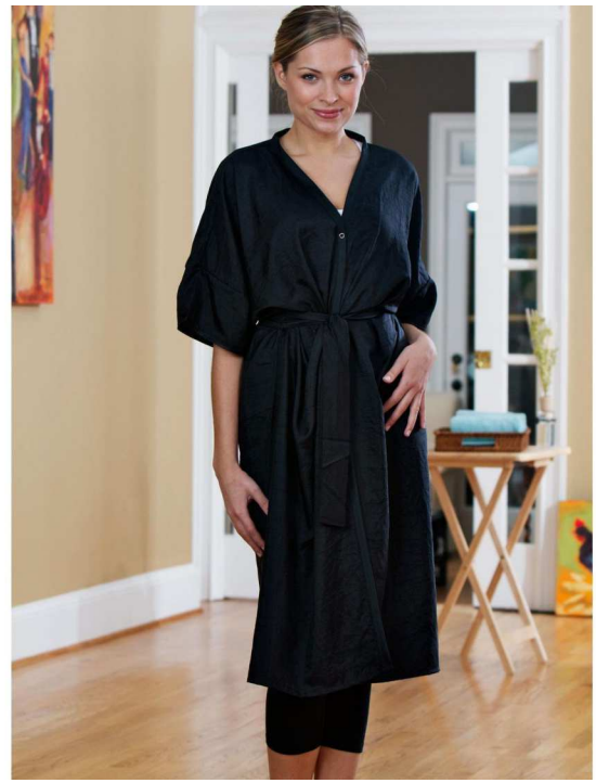
Betty Dain Client Comfort Wrap, Black C5627 $22.95