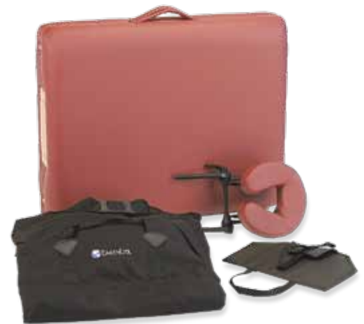
AVALON XD PACKAGE - Flex-Rest™ Facecradle, Single Pocket Carry Case, Armrest Sling