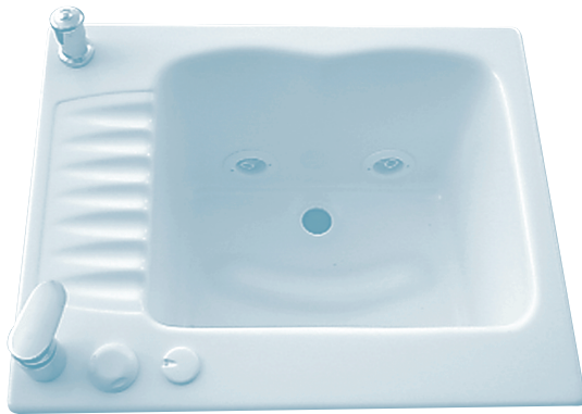
Model #MTLS 110CLV