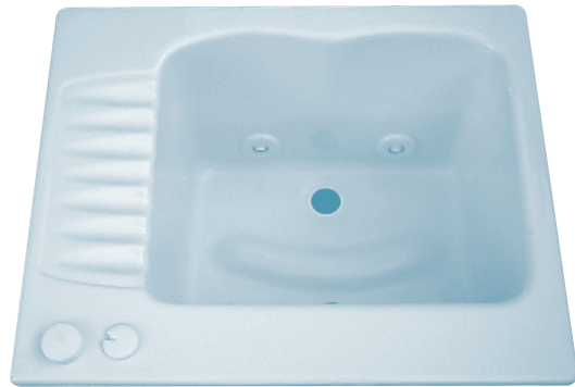
Model #MTLS 110JP