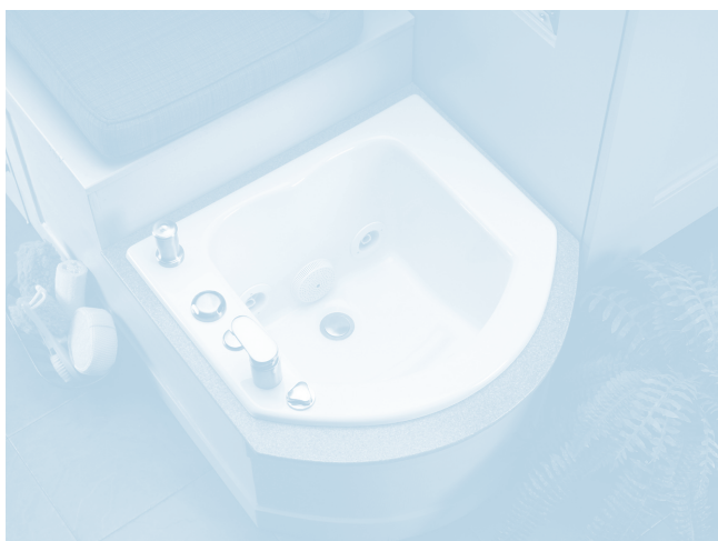
U.S. Patent # 468,816