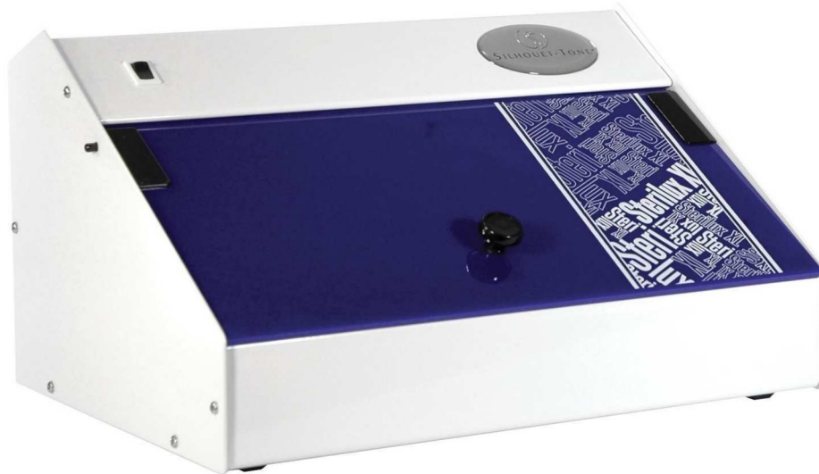
Silhouet-Tone Sterilux, 110V