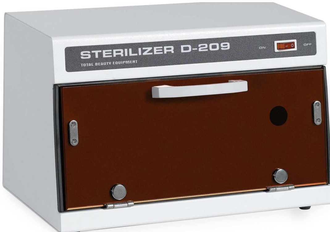
Single Rack UV Sanitizer, 120V