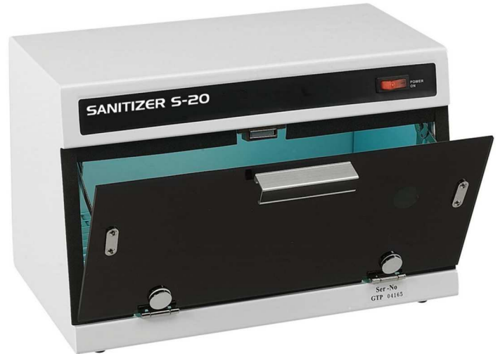
Paragon UV Sanitizer, 120V