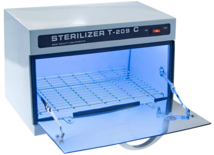
Single UV Sterilizer, 120V