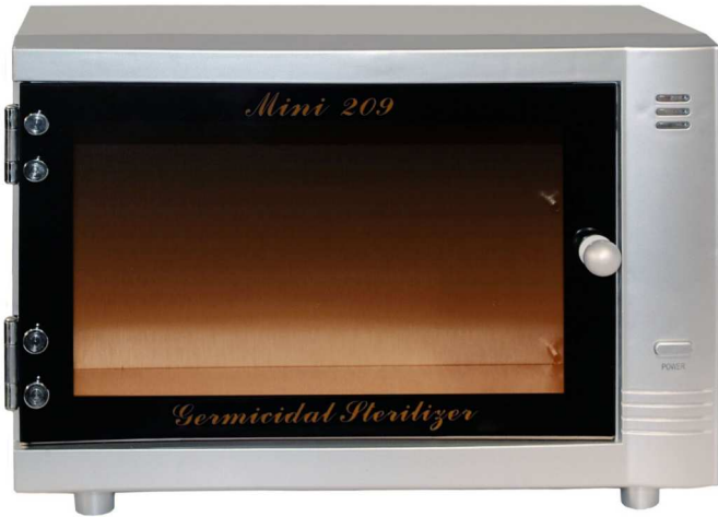
Double UV Sterilizer, 120V