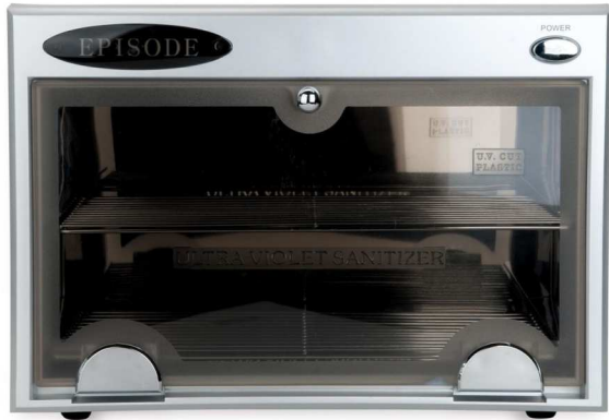
J&A Epi-ray UV Sanitizer, 110V