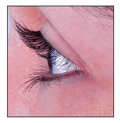
NOTE: If at any time the product gets into the eye, flush thoroughly at your eye wash station or rinse out with lukewarm water. This treatment should NEVER be done on any person with an eye disorder or infection. Keep out of the reach of children.