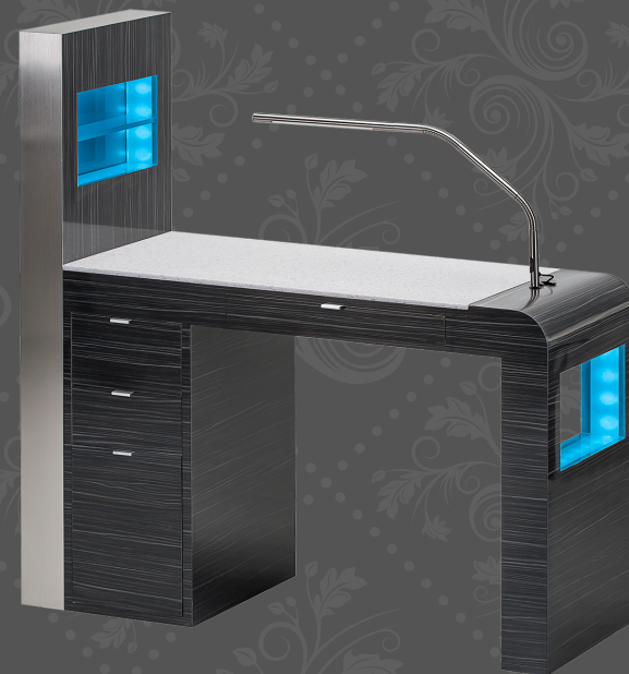
Left & right handed desk options